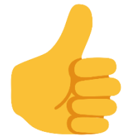
Thumbs Up icon